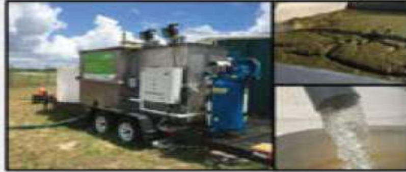
Treating algae-laden water