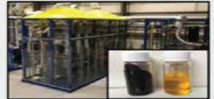
Transforming algal biomass into biofuel