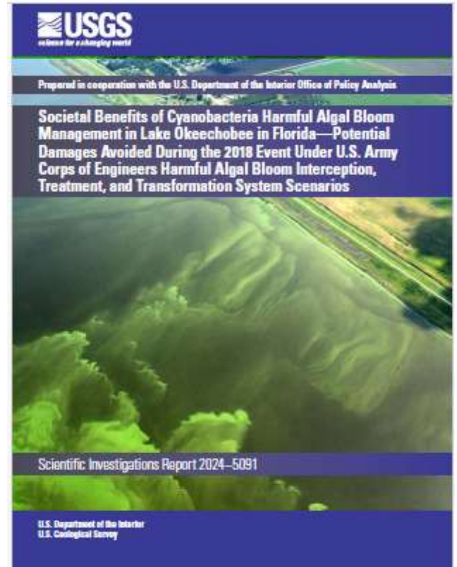
Societal Benefits of Cyanobacteria Harmful Algal Bloom Management in Lake Okeechobee in Florida