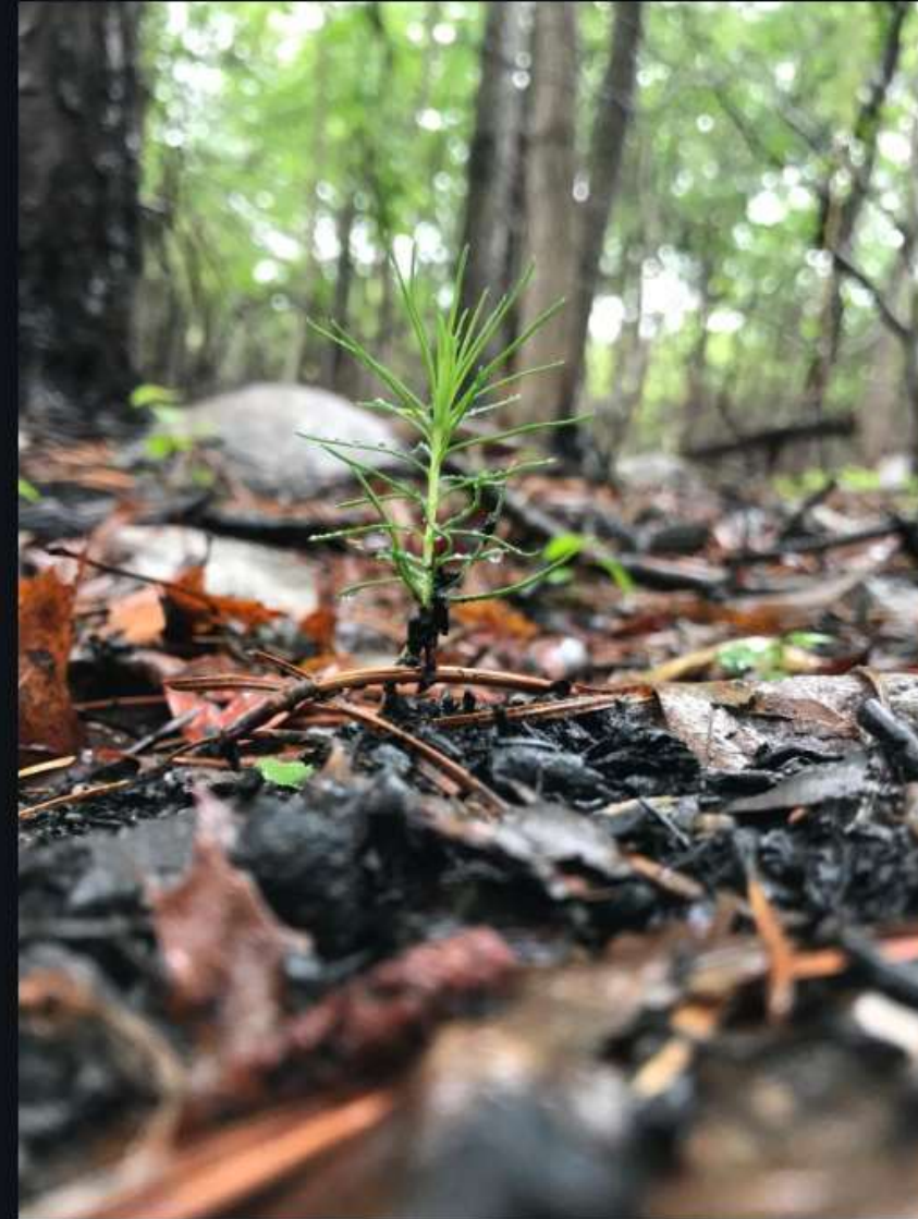
Pitch Pine seedling, spring 2017, following November 2016 burn.

layer, while also helping to reduce the density of young, mixed