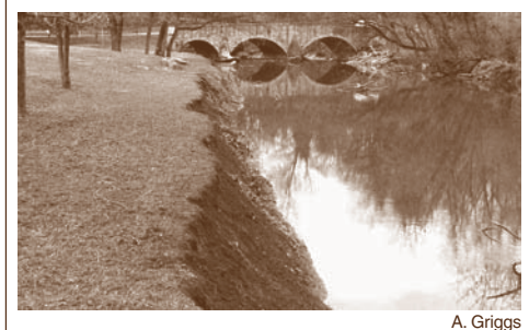
Antietam Creek near Funkstown, Md. The ACWA will focus on problems such as severe bank failure. About 79 percent of the creek's buffer zones are inadequate.

The ICPRB and Maryland DNR Forest Service have helped strengthen ACWA's meetings and future project plans and will continue to direct resources to the group until they can operate without assistance. With a strong organizational structure, the