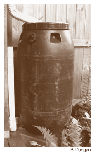
A rainbarrel in action.

homeowners want. Reasons for the vast expanses of turf range from believing that a lush lawn is a healthy lawn to believing that shrubs will bring vermin into the home. Neither are true. Lush lawns often require heavy