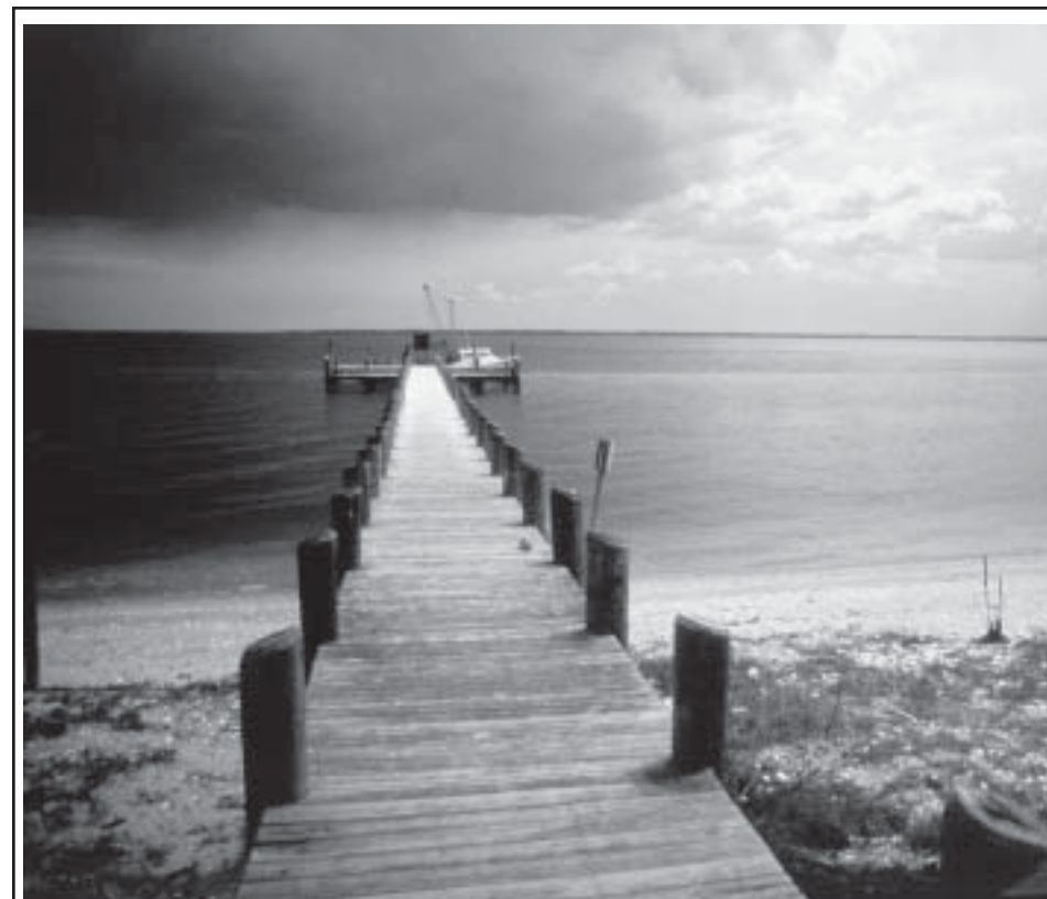
Potomac River near Colton's Point, St. Mary's County, Md.

A workshop for water utilities, planning agencies, elected officials, and other interested stakeholders in the Coastal Plain area of the Potomac River Basin.